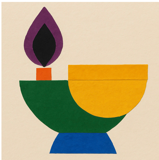
Creating a 'Divali' lamp using cut out shapes from coloured paper