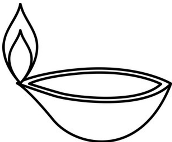
Drawing of 'Divali' lamp