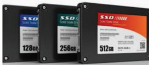
Solid State Drive