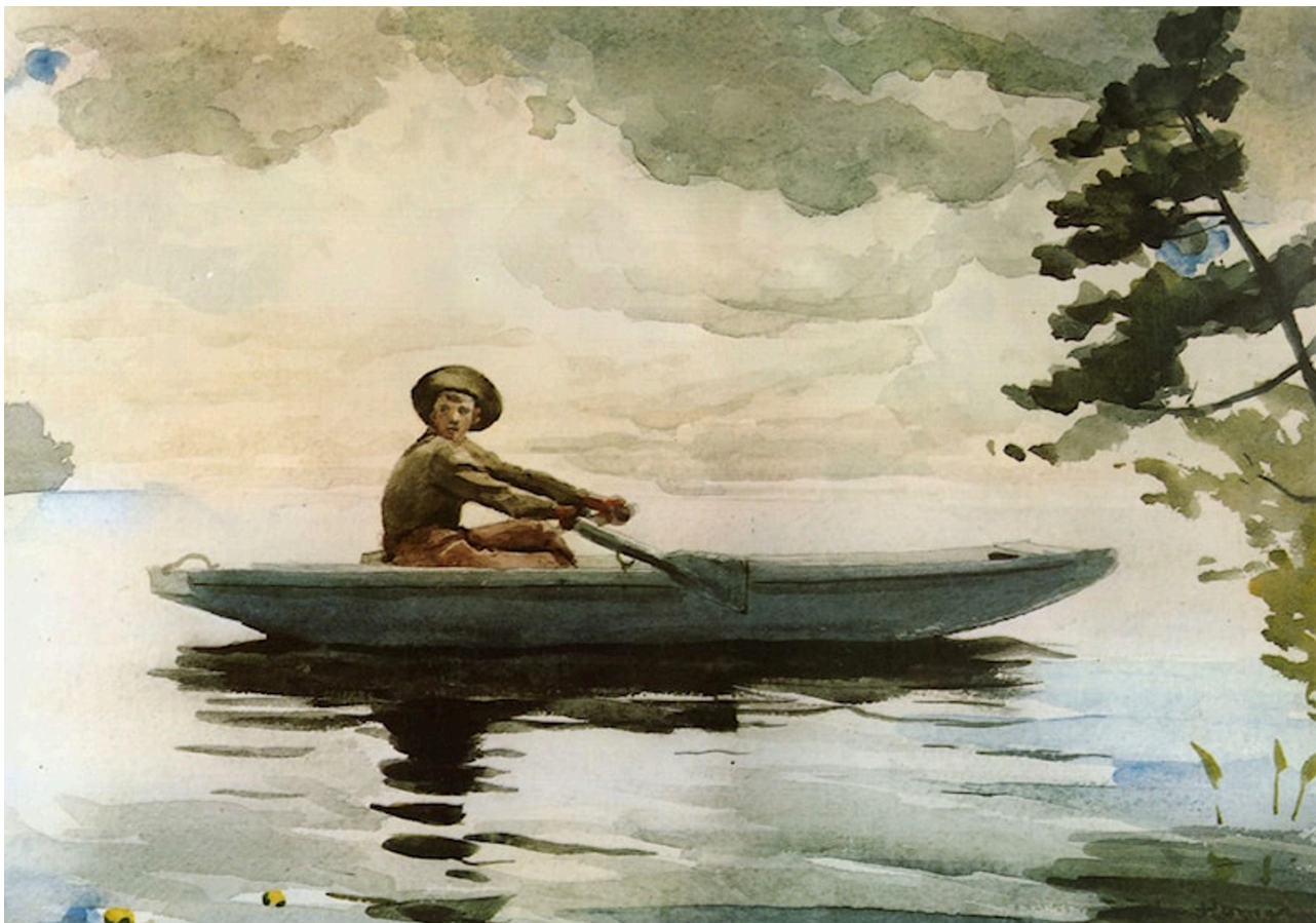
Winslow Homer, 'The Boatman', 1891