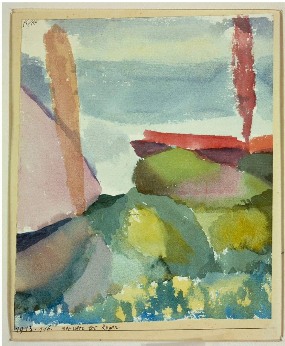
Paul Klee, 'The Seaside in the Rain', 1913, Watercolour