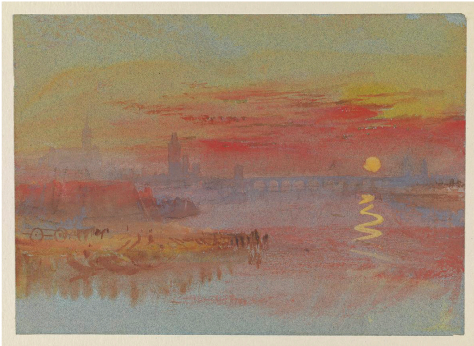
William Turner, 'Scarlet Sunset', 1830, Watercolour